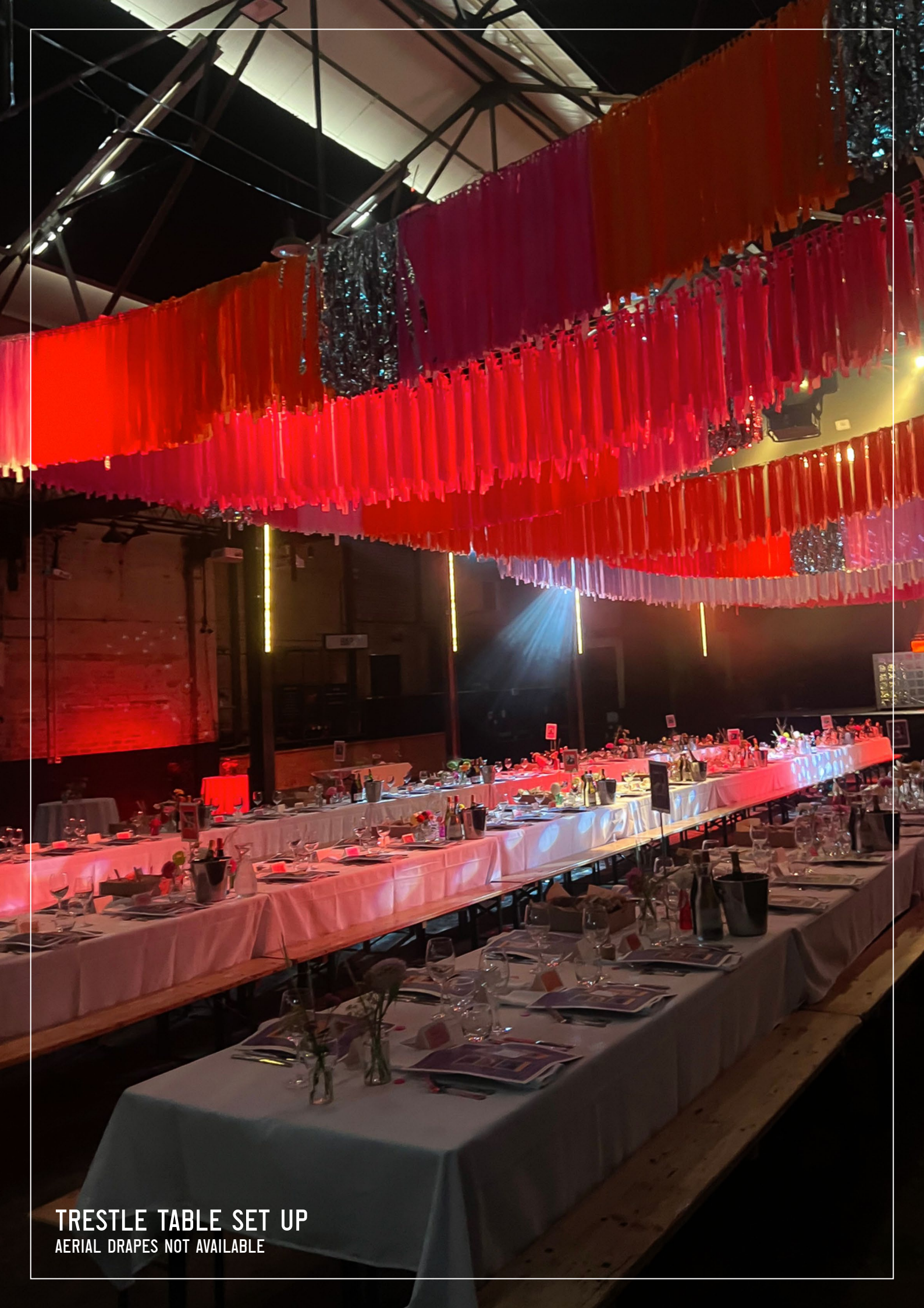
TRESTLE TABLE SET UP AERIAL DRAPES NOT AVAILABLE